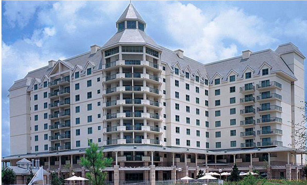
EFCO Series SX45 Horizontal Slider

This Environmental Product Declaration (EPD) was prepared in accordance with ISO 14025 and 21930 using the Earthsure Cradle to Gate Window Product Category Rule 30171600-2015. EPDs are not intended to make comparisons with other products due to varying background data in LCA softwares and/or varying program operator rules or Product Category Rules. An EPD is informational and does not warrant performance. Valid 22 May 2017 through 21 May 2022.