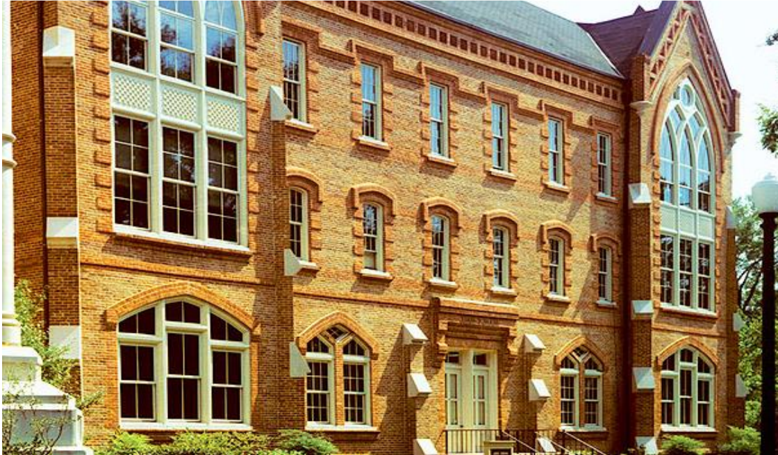
EFCO Series 3900 Fixed

This Environmental Product Declaration (EPD) was prepared in accordance with ISO 14025 and 21930 using the Earthsure Cradle to Gate Window Product Category Rule 30171600-2015. EPDs are not intended to make comparisons with other products due to varying background data in LCA softwares and/or varying program operator rules or Product Category Rules. An EPD is informational and does not warrant performance. Valid 22 May 2017 through 21 May 2022.